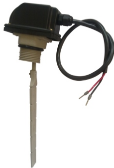
FSW - P-251